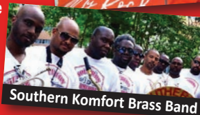
Southern Komfort Brass Band